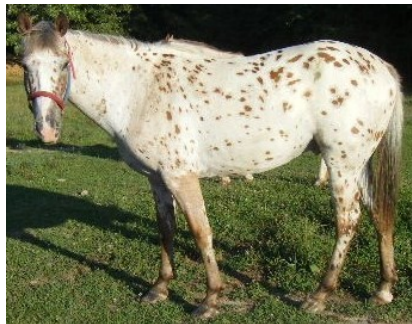
Joker's Rain Drop, WHA 0508 (Pushers Chili Pepper's sire)