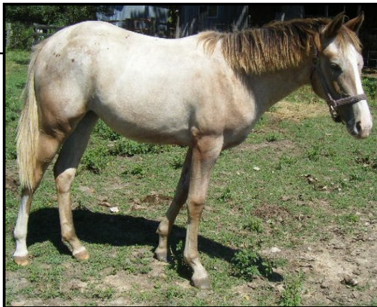
...and Chili Pepper now!