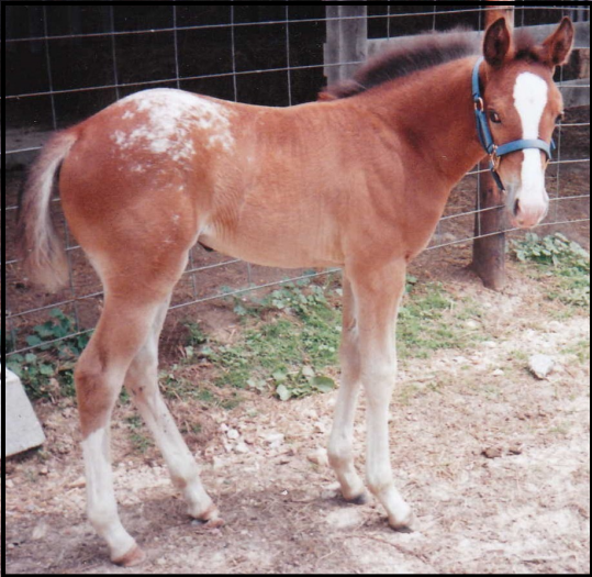
Pusher's Chili Pepper then.....