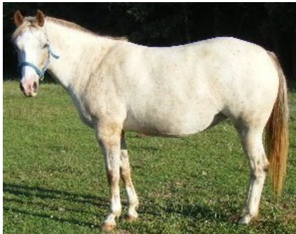
April Rain Bonnet, WHA 0203 (Pushers Chili Pepper's dam)