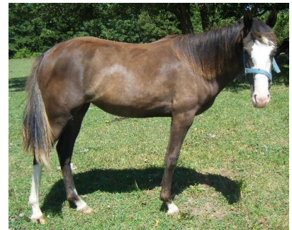
Pusher's Latigo, WHA 0801 (sired by Joker's Rain Drop)